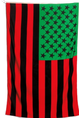
Above: "(Untitled) The African American Flag," artwork by artist David Hammons in 1990, combines the colors of the Pan-African flag with the pattern of the flag of the United States to represent African American identity.