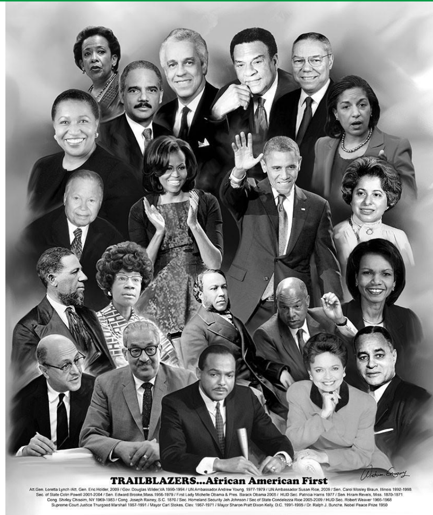
TRAILBLAZERS...African American First Att. Gen. Loretta Lynch/Att. Gen. Eric Holder, 2009 / Gov. Douglas Wilder, VA, 1990-1994 / UN Ambassador Andrew Young, 1977-1979 / UN Ambassador Susan Rice, 2009 / Sen. Carol Moseley Braun, Illinois, 1990-1998 Sec. of State Colin Powell, 2001-2004 / Sen. Edward Brooke, Mass., 1966-1979 / First Lady Michelle Obama & Pres. Barack Obama, 2009 / HUD Sec. Patricia Harris, 1977 / Sen. Hiram Revels, Miss., 1870-1871 Cong. Shirley Chisholm, NY, 1968-1983 / Cong. Joseph Rainey, S. C., 1870 / Sec. Homeland Security Jeh Johnson / Sec. of State Condoleezza Rice, 2005-2009 / HUD Sec. Robert Weaver, 1966-1968 Supreme Court Justice Thurgood Marshall, 1957-1991 / Mayor Carl Stokes, Cleveland, 1967-1971 / Mayor Sharon Pratt Dixon Kelly, D. C., 1991-1995 / Dr. Ralph J. Bunche, Nobel Peace Prize, 1950